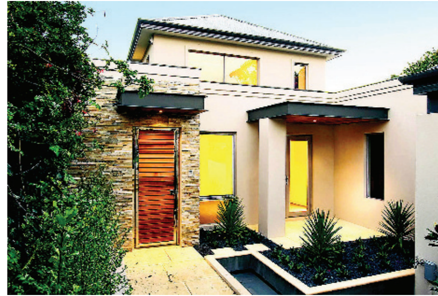
Limestone paths and stepping stones wind past landscaped gardens to the two entry points.

one door, a separate toilet and an open powder room area with a single vanity and mirror. At the front of this level, on the other side of the staircase and a good distance from the children's or guests' bedrooms, is the opulent main suite. Solid double doors open to the sleeping area, which has a row of three vertical frosted windows along one wall and a big horizontal window on the other to flood the room with as much natural light as possible. A sunken spa bath in the corner of the ensuite is visible from the sleeping area through a big window, creating a luxurious hotel-like feel. There is an open entry to the ensuite off the bedroom, as there is to the long, dressing room-style walk-through robe which runs the length of the room. The ensuite has twin integrated basins in a long vanity with a full-height mirror flanked by glass display shelves. In the rear corner is a big shower with frameless glass screens and feature tiling, and there is a separate toilet.